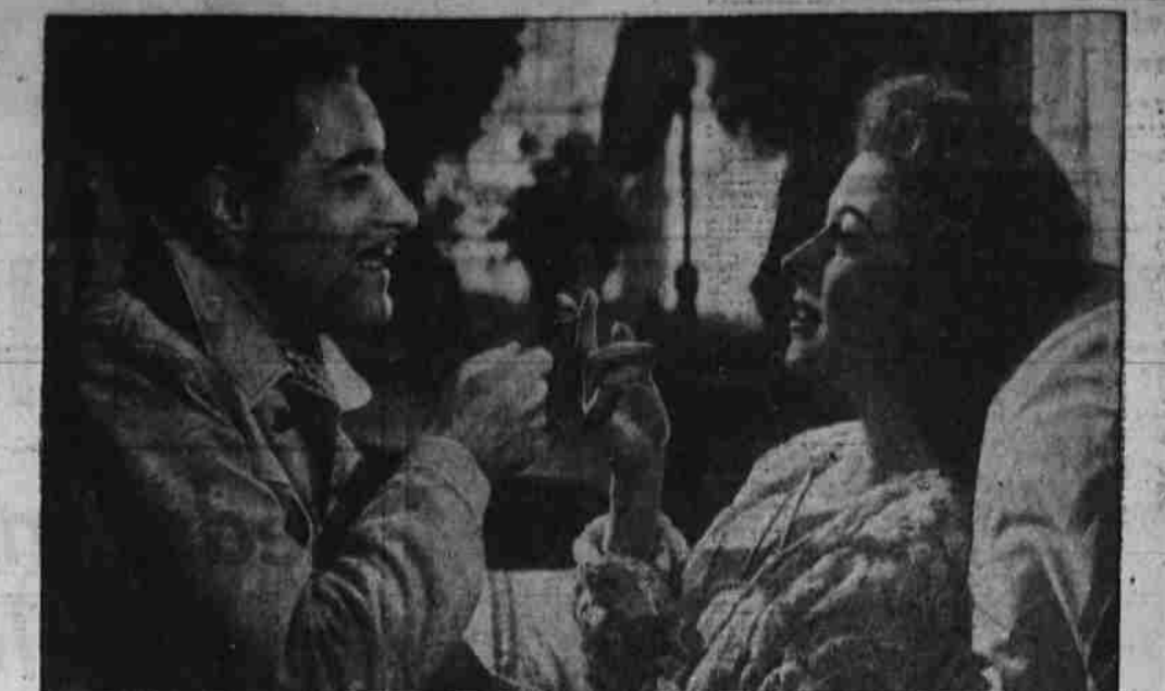
In Hilton Story —Ronald Colman and Greer Garson merge talents to bring forth a moving drama in "Random Harvest," the picture based on James Hilton's outstanding novel. "Random Harvest" is the State theatre's featured attraction for today and Monday.