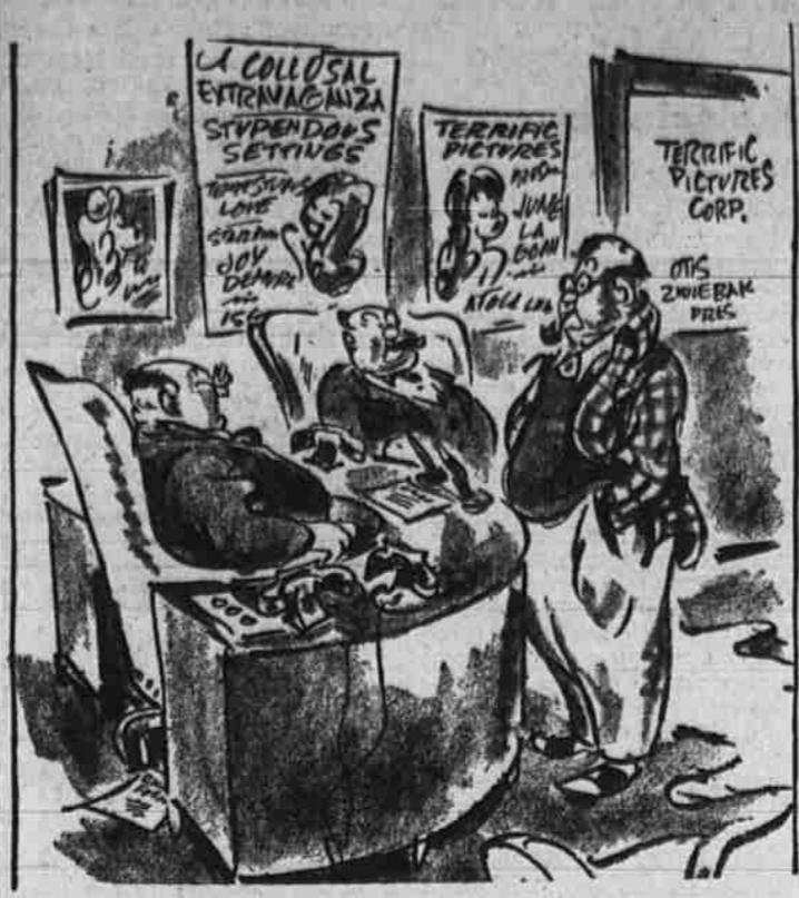
"Stupendous, gigantic, colossal! Bah! I hope the publicity department is doing some postwar planning in regard to a new and revolutionary adjective!"