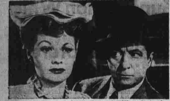
Musical Stars —Lucille Ball and William Gaxton have the top roles in "Best Foot Forward," a Technicolor film presentation based on the favorite Broadway musical of last season. Harry James and his orchestra add to the festivities of an uproarious story of a movie star who visits a prep school. "Best Foot Forward" is at the Ritz today and Monday.

Colman plays his role with convincing force, and Miss Garson is charming and wears some beautiful gowns. Each makes the most of a difficult role. Mervyn LeRoy directed with deft skill. Clever principals include Susan Peters, Phillip Dorn, Reginald Owen and Una O'Connor.