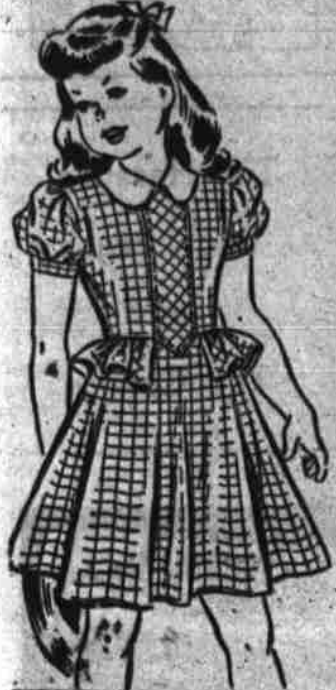
2429 SIZES 2 - 8

The contrasting rounded collar gives real crisp school air to a rippling peplum dress! Choose a dark plaid gingham—very new and popular with the younger crowd.