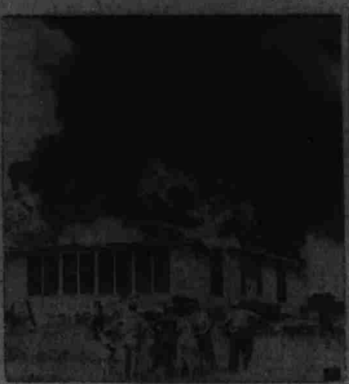
BELL TOWER TOPPLES IN SCHOOL FIRE — The bell tower on a school building at Clive, Ia., topples into the roof as the building is consumed by fire that started during summer repairs to the furnace. The building was a total loss. About 125 pupils will have to seek other quarters when school repairs next month. There was no estimate of the loss.