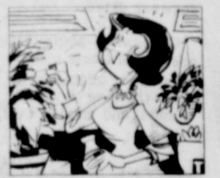
KEEPING LEAVES DUST-FREE is just one favor you can do for your plants.