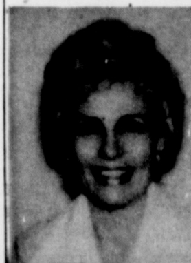
Jane Simpson Agency

MOBILE HOME HOMEOWNERS AUTOMOBILE COMMERCIAL BOAT