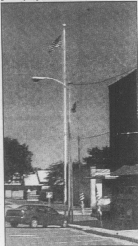
The flag is once again flying at full staff.