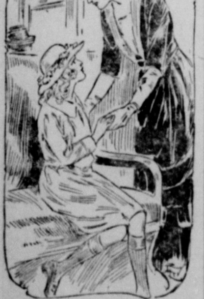
Then the Conductor Called “All Aboard!” and the Bell Rang, and She Had to Go and Leave Me.

There was a young gentleman in the seat in front, too, who was very nice. He loaned me a magazine, and bought some candy for me; but I didn't see much more of him, for the second time the conductor came in he told me he'd found a nice seat back in the car on the shady side. He noticed the sun came in where I sat, he said. (I hadn't noticed it specially.) But he picked up my bag and magazine—but I guess he forgot the candy box the nice young gentleman in front had just put on my window-sill, for when I got into my new seat the candy wasn't anywhere.