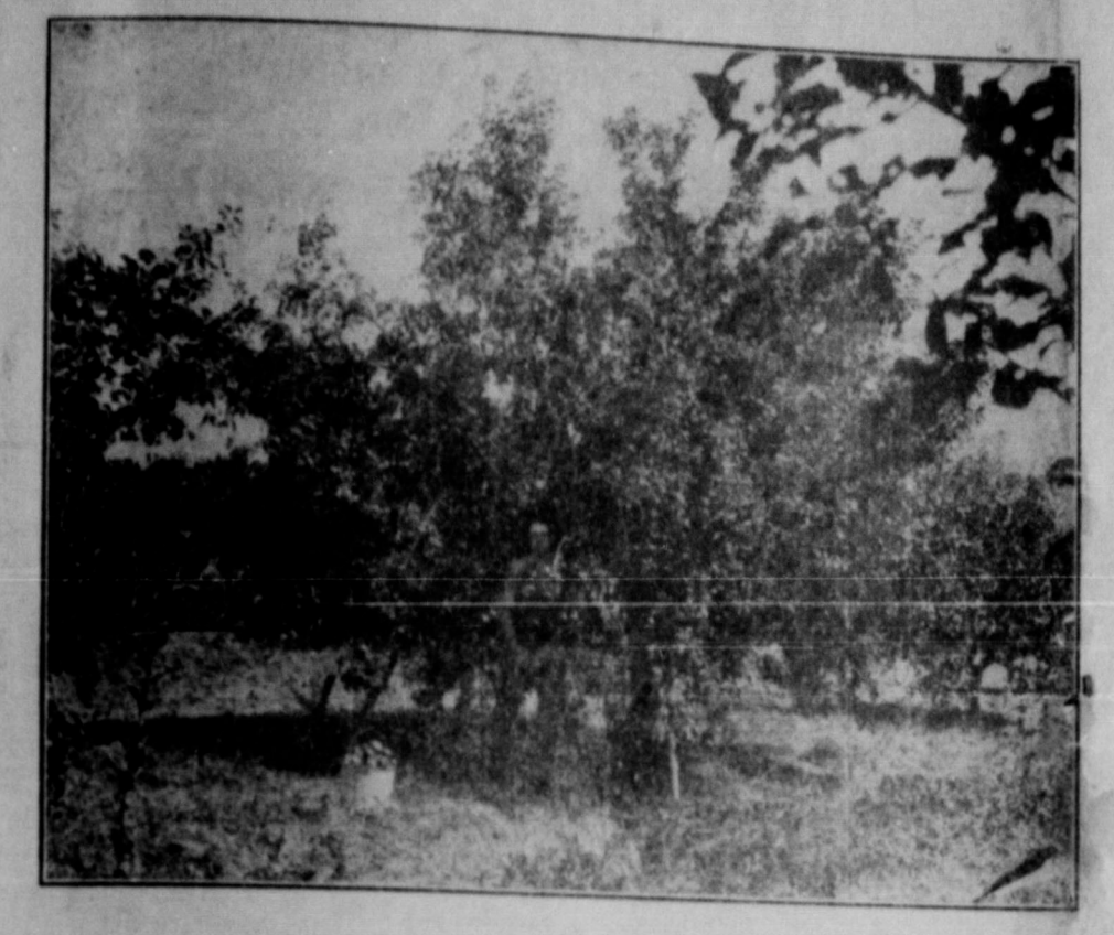
Apple tree in Milwood orchard 3 miles south of McLean