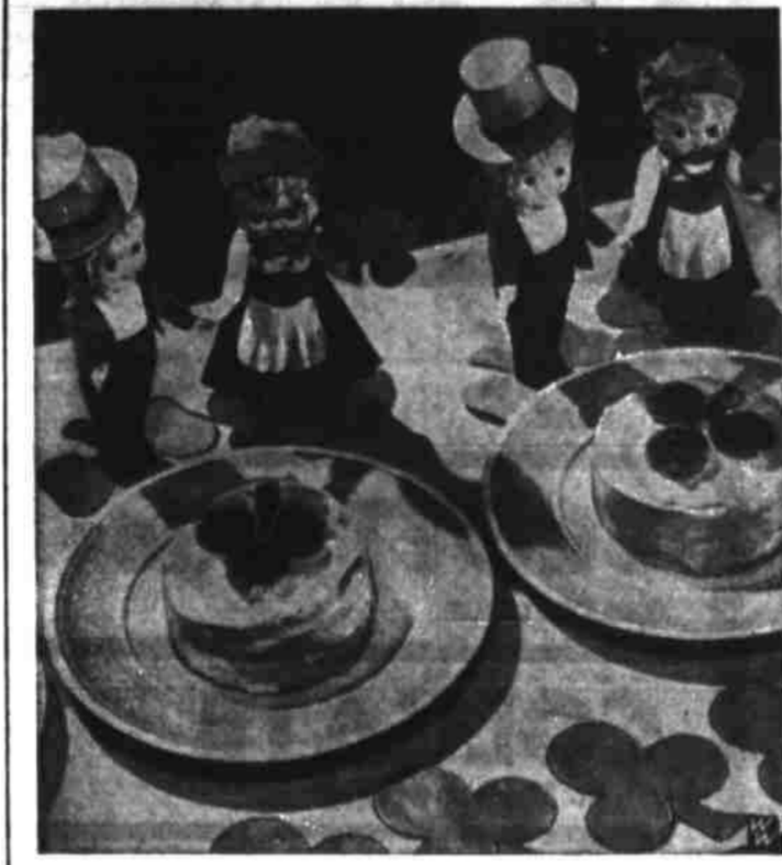
Lemon Cakes . . . Tough on St. Patrick; he missed this.