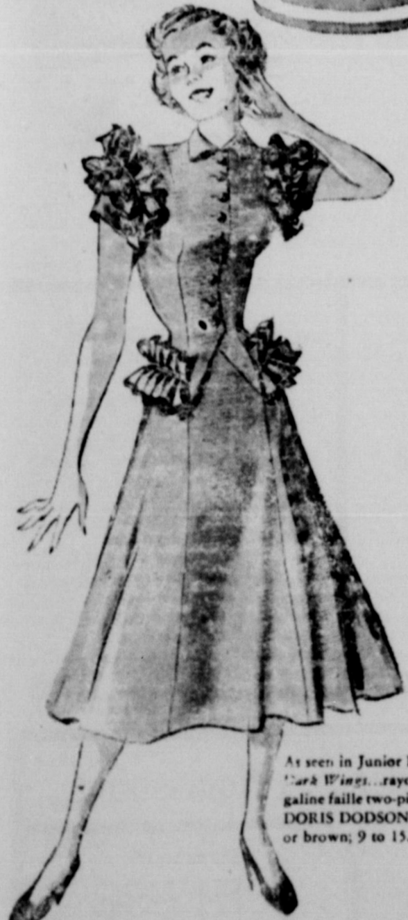
As seen in Junior Bazaar, "Cock Wines" rayon bengaline faille two-piece by DORIS DODSON. Black or brown; 9 to 15.

There's a New Look to fashion... and a New Look to you! Doris Dodson chooses romantic, rustling rayon faille... to whisper as you walk, to cinch your waist into a handspan, to round and lengthen your silhouette to a graceful shadow.