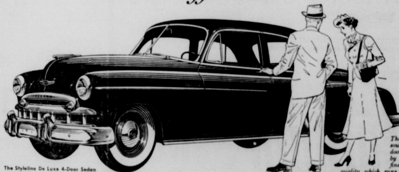
The Styline De Luxe 4-Door Sedan White sidewall tires optional at extra cost.

See the difference... Hear the difference!