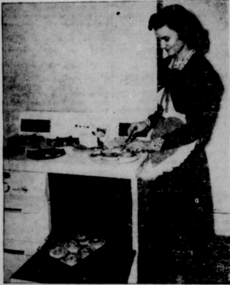
A pretty homemaker who knows her culinary artistry adds the finishing touch to piping hot cinnamon rolls by spreading them with rich, creamy margarine. She finds the new margarine recipe booklet, "Mealtime Marvels," a handy aid in planning tempting, nutritious dishes that are easy to prepare. This newspaper introduces a series of recipe "marvels" adapted from the new margarine recipe booklet.