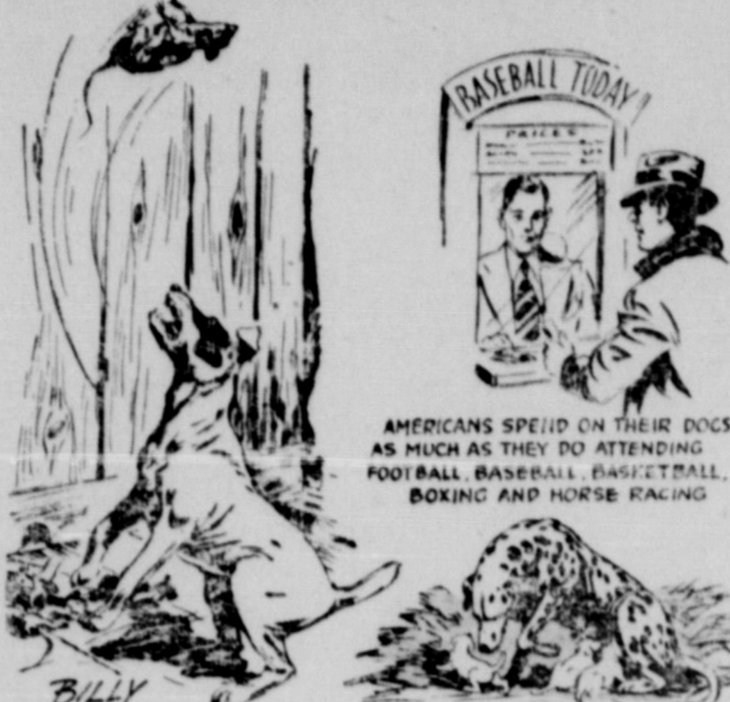
BILLY FAMOUS ENGLISH TERRIER ONCE KILLED 100 RATS IN 5 MINUTES AND 30 SECONDS