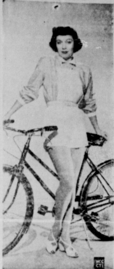
Academy Award winner Jane Wyman is a glamor girl in her own right. Audiences will see the talented actress in this trim cotton shorts outfit in her new Warner Bros. picture, "Kiss in the Park." The tailored blue chequer blouse has a mandarin collar of white tulle.