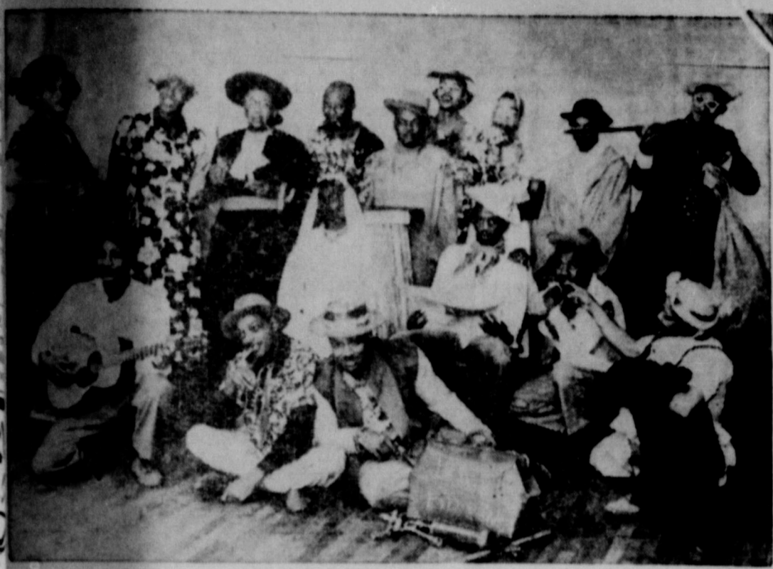
CHILDREN'S COLOR GALORE in the show, "Speedy in the Shotgun Wedding," to be presented here tonight in the McLean High School auditorium. The show, which will begin at 8 o'clock, features an all-Negro cast, and has been presented a number of times in this area. Admission is 75 cents for adults and 35 cents for children, with net proceeds going to the American Post in McLean.