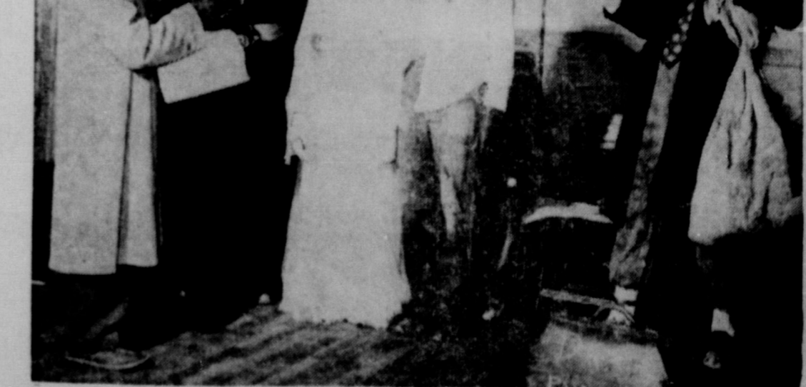
HERE'S A SCENE from the show, "Speedy in the Shotgun Wedding," to be presented in the McLean High School Auditorium Friday night, beginning at 8 o'clock. The show is being brought here by the local American Legion Post, and features an all-Negro cast from Pampa. Admission will be 75 cents for adults and 35 cents for children, with net proceeds going into the activity fund of the Legion.

When man seized the loadstone of science the loadstar of superstition vanished in the clouds. —William R. Alger.