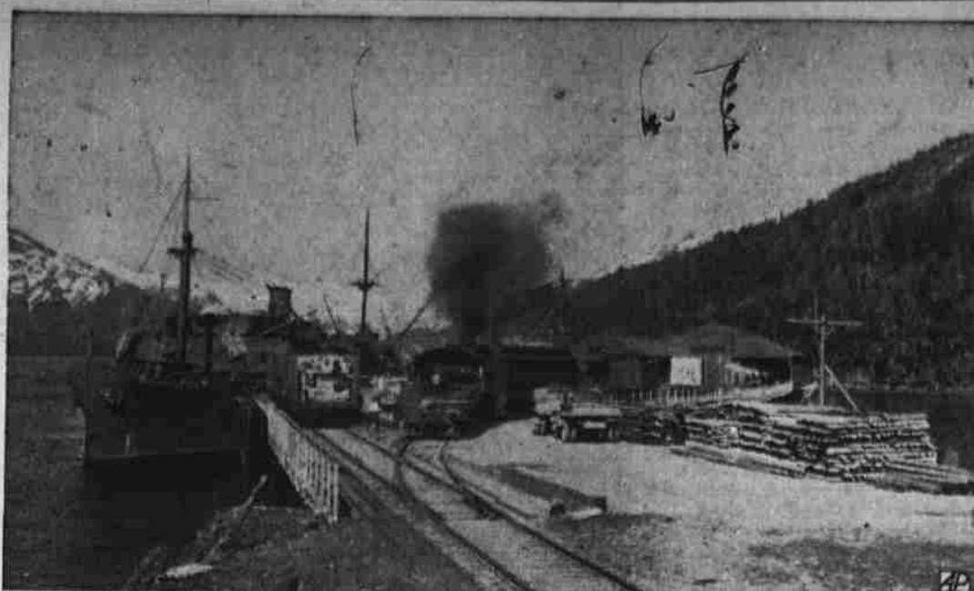
SUPPLIES FOR ALASKA —A vessel from Seattle, carrying cargo for the interior of Alaska, docks at Whittier, where the new rail connection provides an easier, shorter route.

AT FIRST SIGN OF A COLD USE 666 666 TABLETS, SALVE, NOSE DROPS