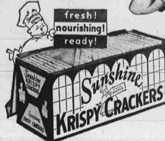
LOOSE-WILES BISCUIT COMPANY—Brown Cracker and Candy Company Division

Now, as always, popular Sunshine Krispy Crackers are the perfect accompaniment to soups, salads and spreads. But why not enjoy their delicate flavor right through meals... with meat, vegetables, fruit. Housewives find this an economical way to give their families extra food-energy.