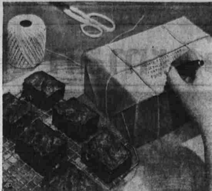
BRAN FUDGE SQUARES: A-1 with the Army.