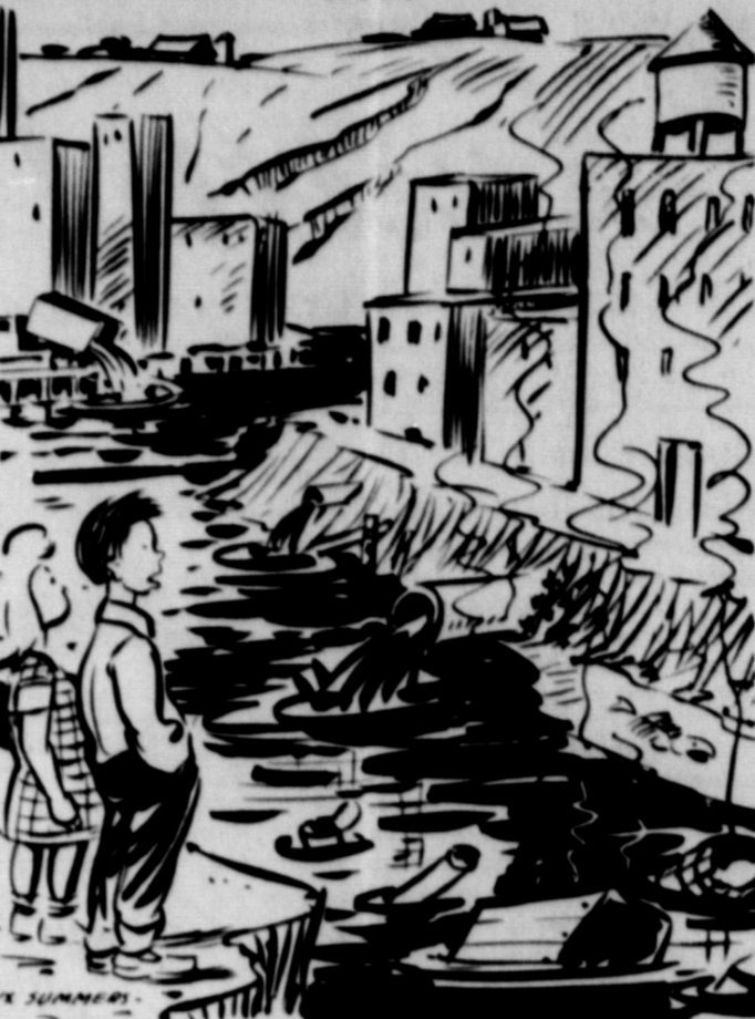
"Grownups sure leave a mess!"

U. S. DEPARTMENT OF AGRICULTURE SOIL CONSERVATION SERVICE