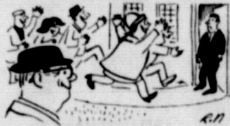
"A man whose ship comes in usually finds most of his relatives at the dock."

Most of the increase in the price of beef has not been brought about by the increase in the price of cattle on foot. It has been brought about because of increased labor cost in the packing houses and in the meat trade after the finished cattle leave the feedlot.