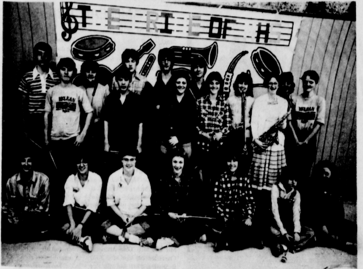
THESE MCLEAN HIGH School band members brought home several awards from the UIL Solo and Ensemble contest in Canyon last weekend. (If you are wondering about the style of dressing, the students were dressing for Fifties Day at the high school when this picture was taken.

Friday, March 14 Chicken pot pie, creamed potatoes, salad, chocolate candy