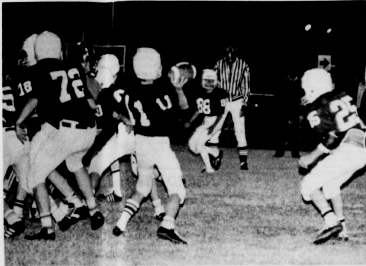
Cubs Battle Pirates