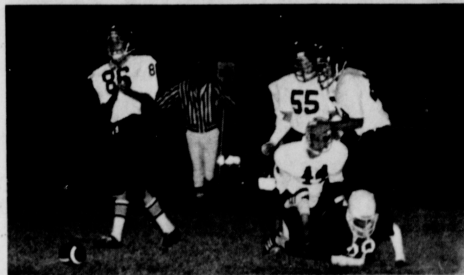
It's Got To Be Here