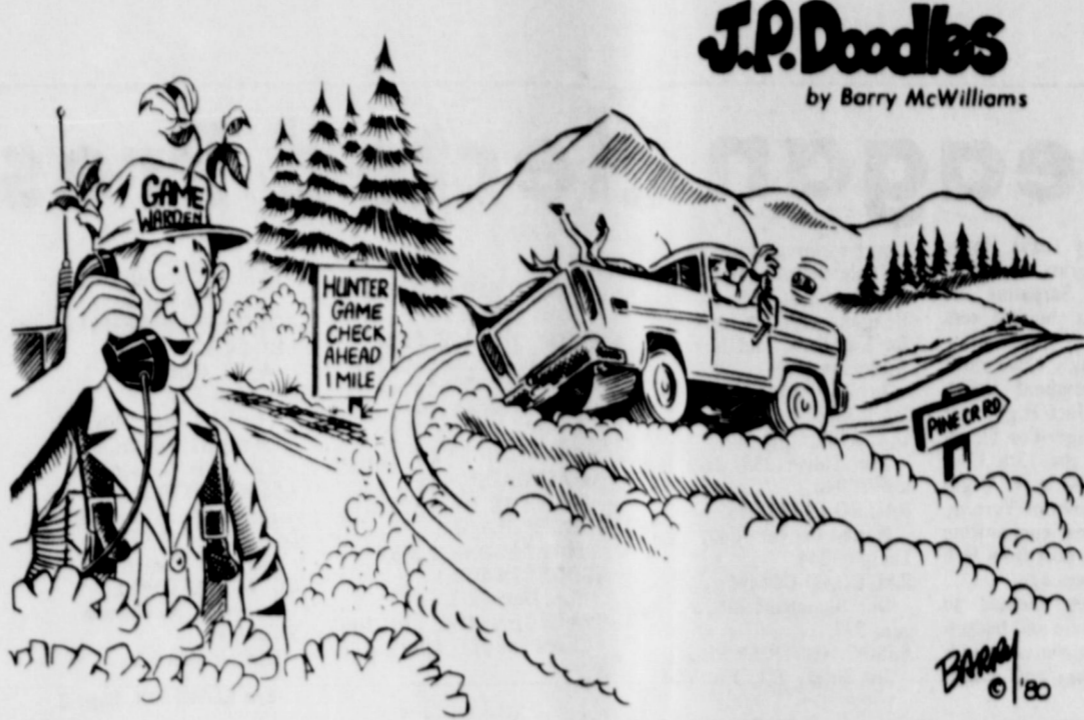
"Mobile unit to Pine Creek Ambush --- another hot one headin' yer direction!"

From The Distaff Side ————— Continued From Page 1