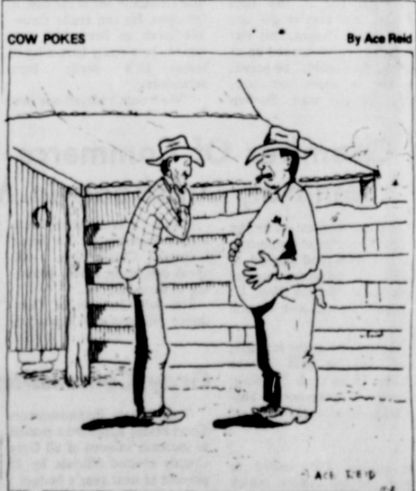
"Now this ain't fat, it's like the world...inflation!"

"COW POKES" IS BROUGHT TO YOU BY THE FRIENDLY FOLKS AT American National Bank in McLean FDIC