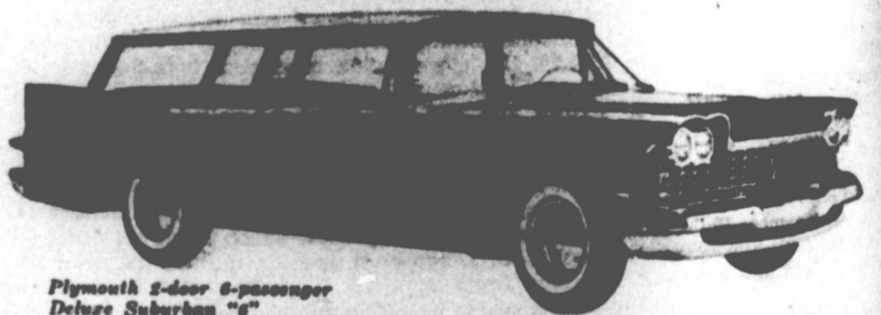
Plymouth 5-door 6-passenger Deluxe Suburban '60'