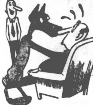
"We call him 'Creeping Socialism'—sticks his nose into everybody's business!"