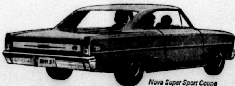
Nova Super Sport Coupe