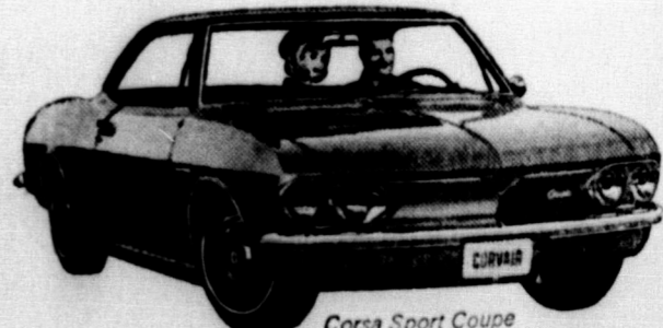
Corvair Sport Coupe