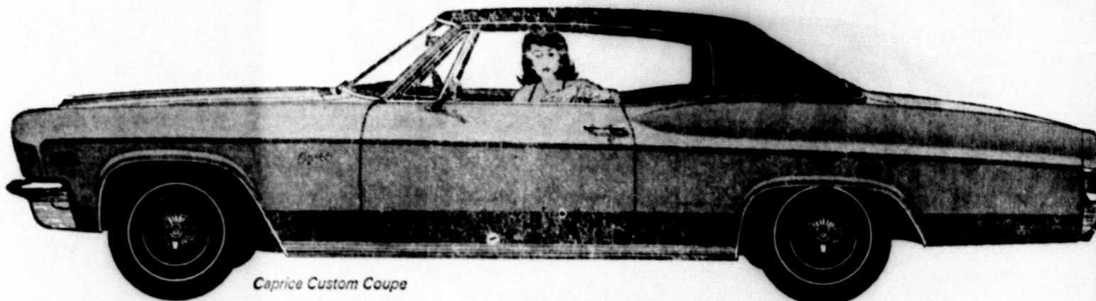
Caprice Custom Coupe