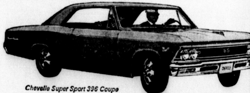
Chevelle Super Sport 396 Coupe

New 300's. New 300 Deluxe models. New Malibus. And two new Super Sport 396's—coupe and convertible—with engines that tell you exactly what kind of Chevelles they are. Both are available with 396-cu.-in. Turbo-Jet V8's, either 325 hp or 360 hp. And both come with special hood, grille, suspension, emblems, red stripe tires, floor-mounted shift. Twelve beautiful new Chevelles in all—and all as new inside as they are outside, headlamps to taillights.