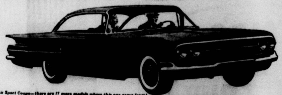
Bel Air Sport Coupe—there are 17 more models where this one came from!

and wonderful... your timing couldn't be better. Corner your Chevy dealer one of these days real soon. See how satisfying it is to do business with a happy man.