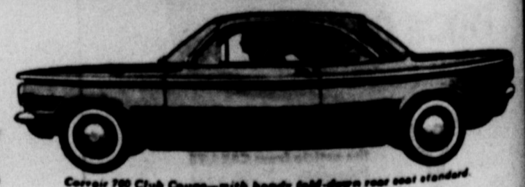
Corvair Club Coupe—with handy fold-down rear seat standard.