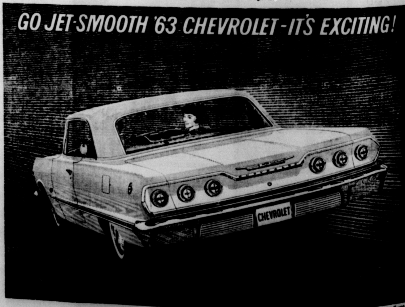
Ask about "Go with the Greats," a special record album of top artists and hits and see four entirely different kinds of cars at your Chevrolet dealer's — '63 Chevrolet, Chevy II, Corvair and Corvettes

KNOX MOTOR COMPANY Ave E & 9th St. Ozona, Texas