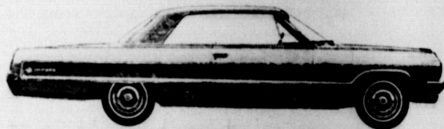
'64 Jet-smooth Chevrolet Impala Sport Coupe (119-in. wheelbase)

VILLAGE DRUG The Store With A Smile In The Shopping Center