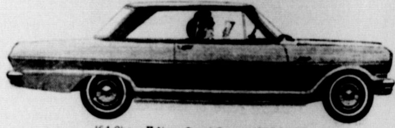
'64 Chevy II Nova Sport Coupe (110-in. wheelbase)