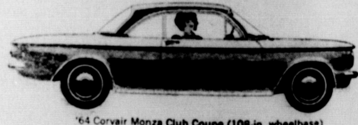
'64 Corvair Monza Club Coupe (108-in. wheelbase)