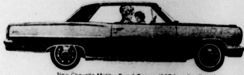
New Chevelle Malibu Sport Coupe (115-in. wheelbase)