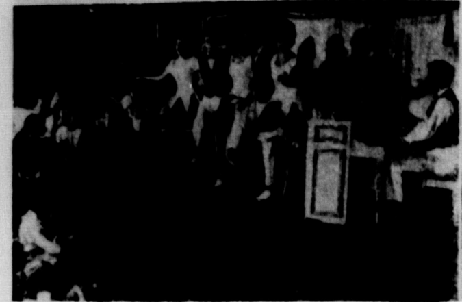
Six entertainers present frontier style shows at the Crazy Horse Saloon in the Texas section of Six Flags Over Texas. These performers are part of the over 1,200 talented collegians employed at Six Flags.

being arranged by Battersby and calls for Miss Wool's first appearances Aug. 3 through Aug. 5 in Amarillo. Other than the Amarillo date, Battersby said the following appearances had been confirmed for Miss Wool of Texas: