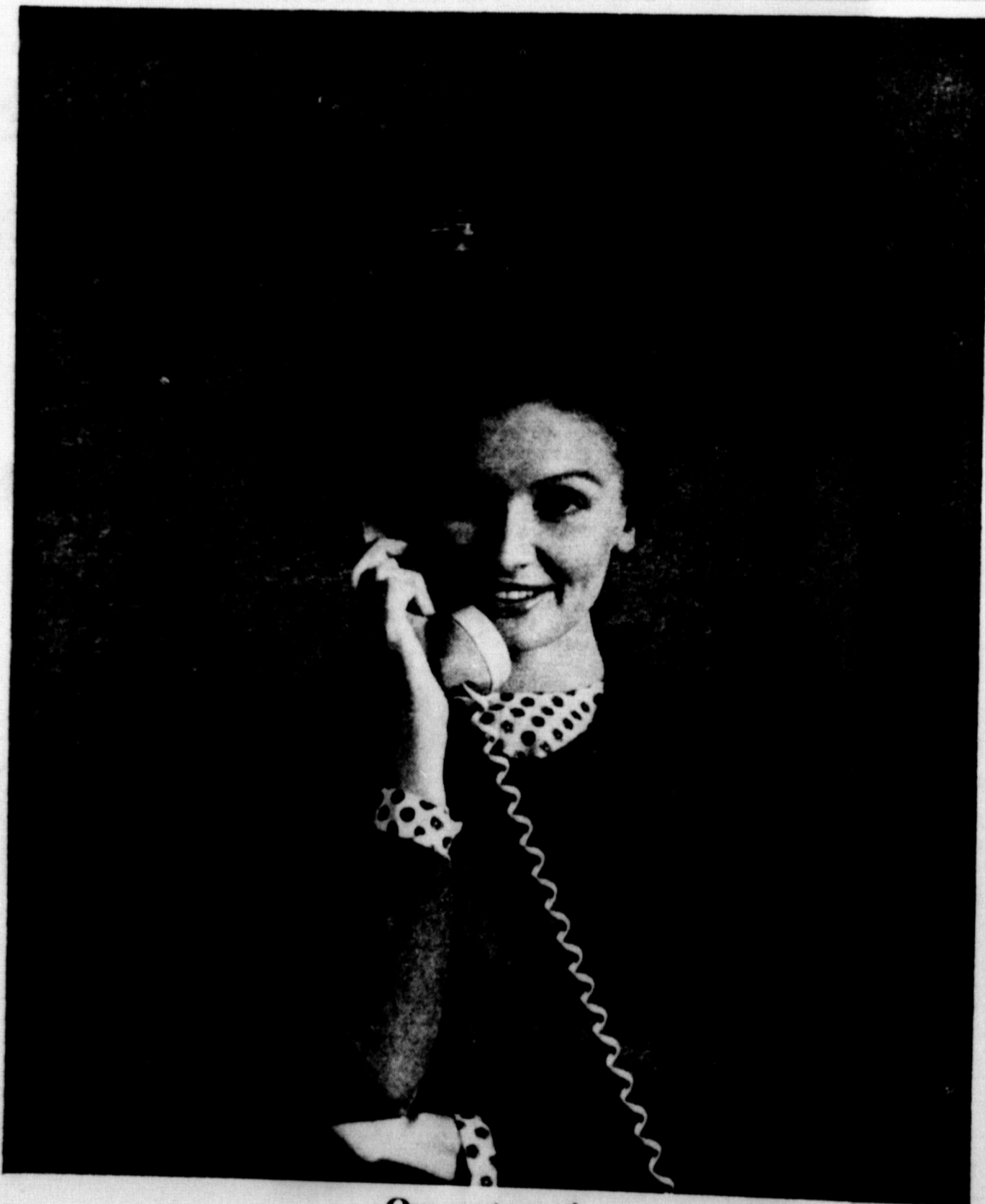
Our customer's representative is a good listener