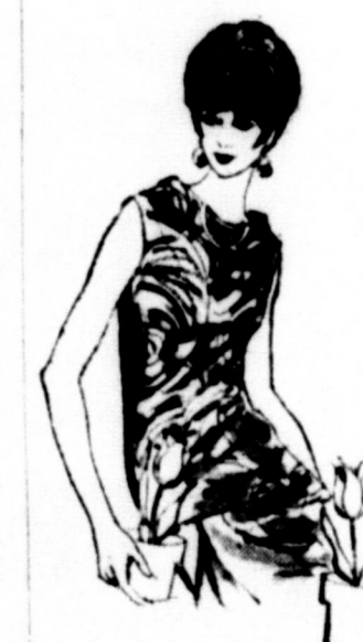
Dresses & Suits

along with Shoes, Bags and all other accessories