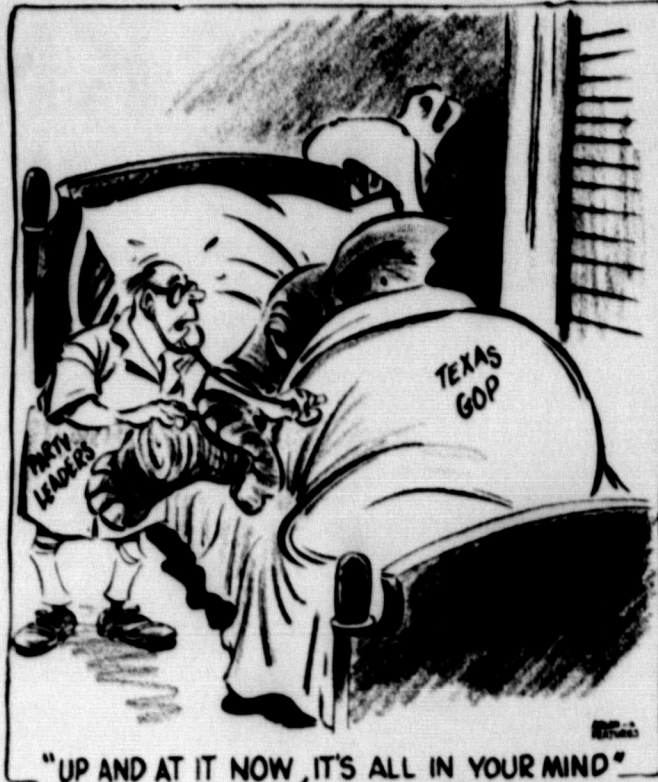
"UP AND AT IT NOW, IT'S ALL IN YOUR MIND"