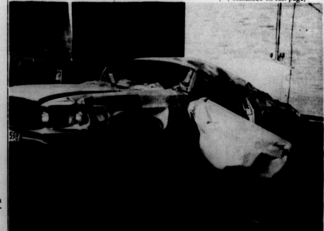
A GRM REMINDER that a three-day holiday weekend is coming up and the traffic fatality rate for Texas has been predicted at 52 persons. The two women, who were in the above auto when it went out of control and overturned three times on IS 10 twelve miles east of Ozona last Saturday are alive to tell about it, in spite of the mangled automobile. Others will not be so fortunate this weekend, if you can't avoid driving on the holiday weekend, do avoid exceeding the speed limit, drinking and driving, and pay close attention to the other driver.