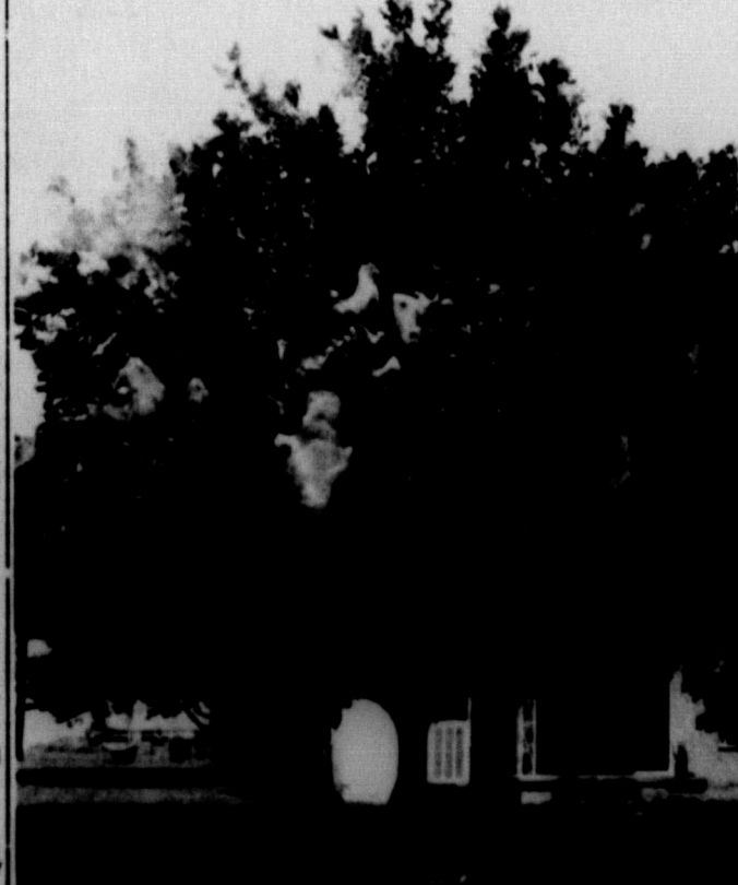
IT'S NOT SPANISH MOSS - It's an invasion of web worms, which has affected most of the trees in town, even those which were sprayed before the rains. The webs, which grow larger each day, are filled with small worms which eat the leaves and bark of trees. Most seriously affected are the town's pecan trees and sprayers are working overtime trying to rid the town of these pests.