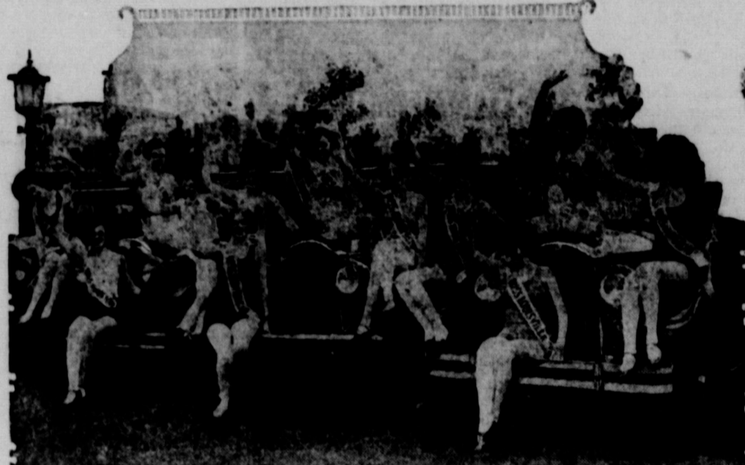
These beauties were among the contestants for the title of Miss America and every one of them looks good enough to win. The Buicks were at their disposal while in Atlantic City.