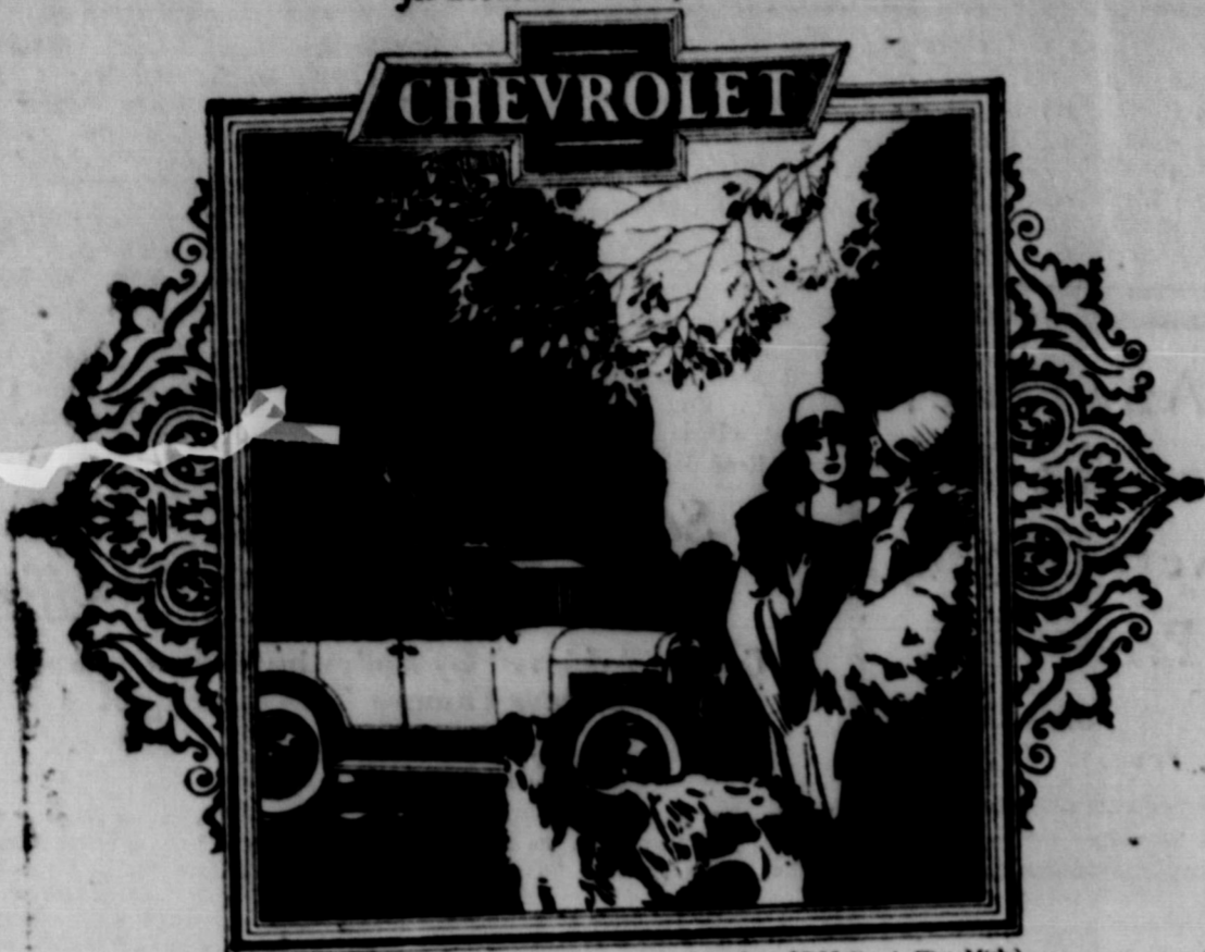
The Landau, $765 (f. o. b. Flint, Mich.)