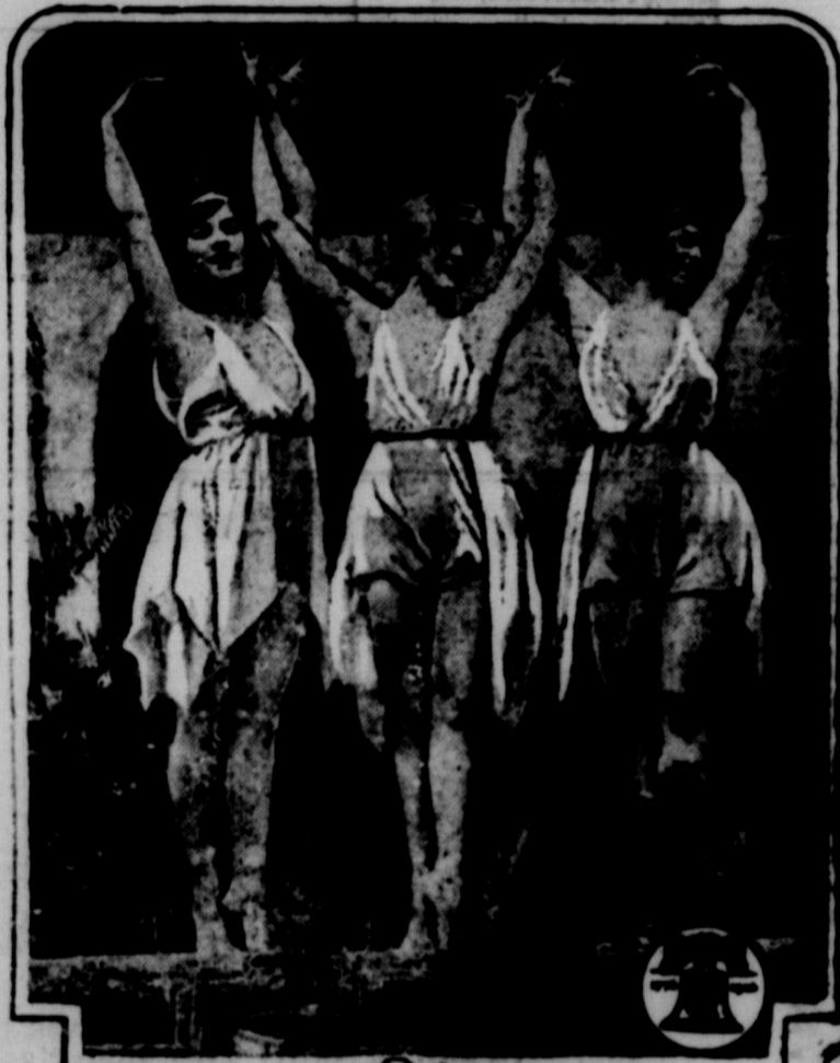
These dancers have selected for their graceful performance the key-shaped pool in the court yard of the Pennsylvania State Building at the centennial International Exposition in Philadelphia, which celebrates four years of American independence. The spot is one of the most beautiful artistic on the exposition site. The Exposition continues until December 1.