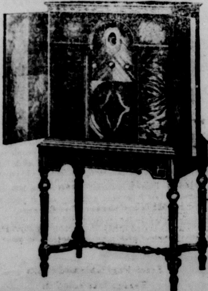
The Mighty Monarch of The Air

A 7-Tube all electric set with dynamic speaker—The radio with the most marvelously natural tone of any set on the market. A beautiful cabinet, a wonderful receiving set at a price that will amaze you. Two of the latest models now on display at our store. Let us demonstrate them to you.