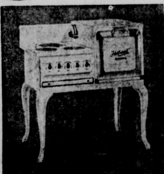
The New All-White Hotpoint Electric Range . . $132.50