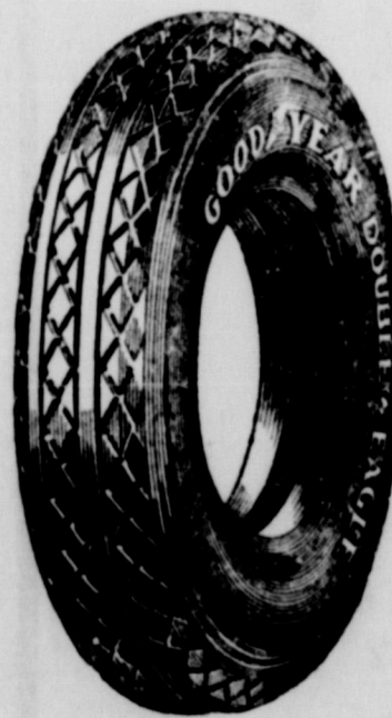
WHEN YOU TAKE TURNS OR CURVES

—the sharp-edged diamond blocks on the SIDES of the Goodyear All-Weather Tread take hold to prevent side-skidding.