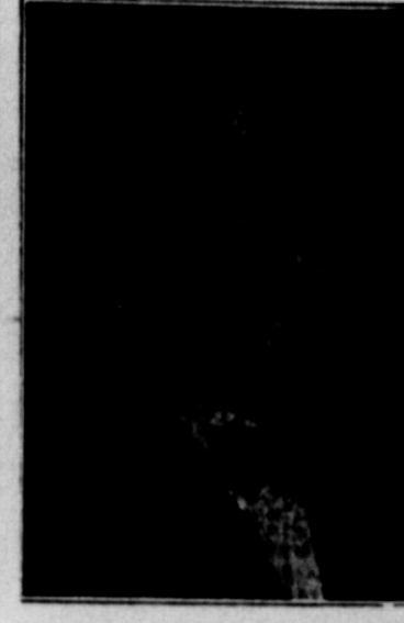
REV. W. D. BLACK