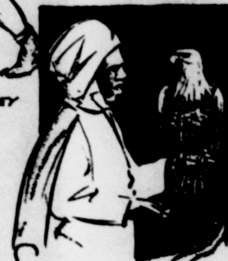
SOME TRIBES OF CENTRAL ASIA TRAIN GOLDEN EAGLES TO CAPTURE WOLVES, WILD-GOATS, FOXES AND ANTELOPES.

Can you "Dig 'Em Up"? If so send them to us, and if acceptable, we will publish with your name.