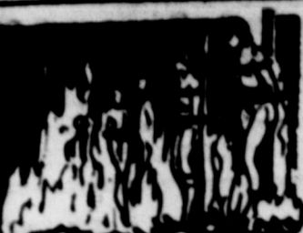
DURING THE MIDDLE AGES - MORE THAN 9,000,000 INNOCENT MEN AND WOMEN THROUGHOUT EUROPE WERE CONDEMNED AS WITCHES AND BURNED AT THE STAKE