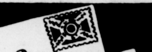
BARRON P. VON FERDINAND'S FAMILY OWNS THE LARGEST STAMP COLLECTION IN THE WORLD - CONTAINS OVER 500,000 SPECIMENS AND IS VALUED AT $2,000,000.