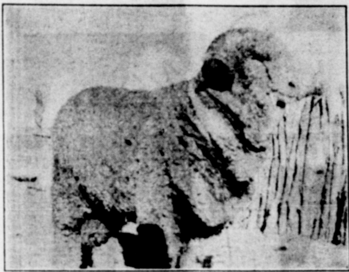
J. W. Owens & Sons—"TUNNY"—846