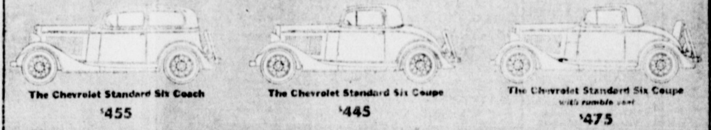
ILLUSTRATED ABOVE—THE RECENTLY ANNOUNCED CHEVROLET STANDARD SIX