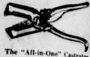
The "All-in-One" Castrator

Here is a new and effective method for castrating lambs. Castrator, docker and ear marker all in one instrument. Practical, convenient and positive.