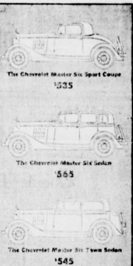
ILLUSTRATED ABOVE—THE CHEVROLET MASTER SIX