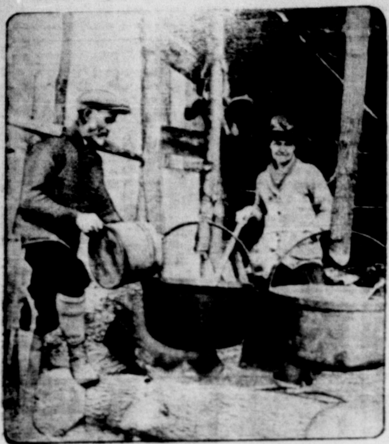
Two Quebec habitants boiling syrup in the traditional fashlon at a rough-opetructed shed. A yoke acros the shoulders enables the man to carry two tickets of sap to the kettles.