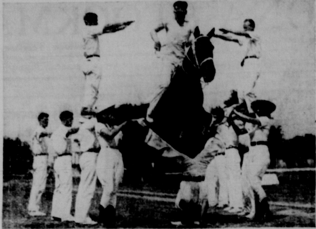
Members of the Rough-Riding Squad of Troop F of the Fifth Cavalry use one of their fellows for order in their monkey drill, one of the many free attractions at the Texas Centennial Exposition at Dallas. The two Rangerettes were added merely to give the picture a little romantic touch.