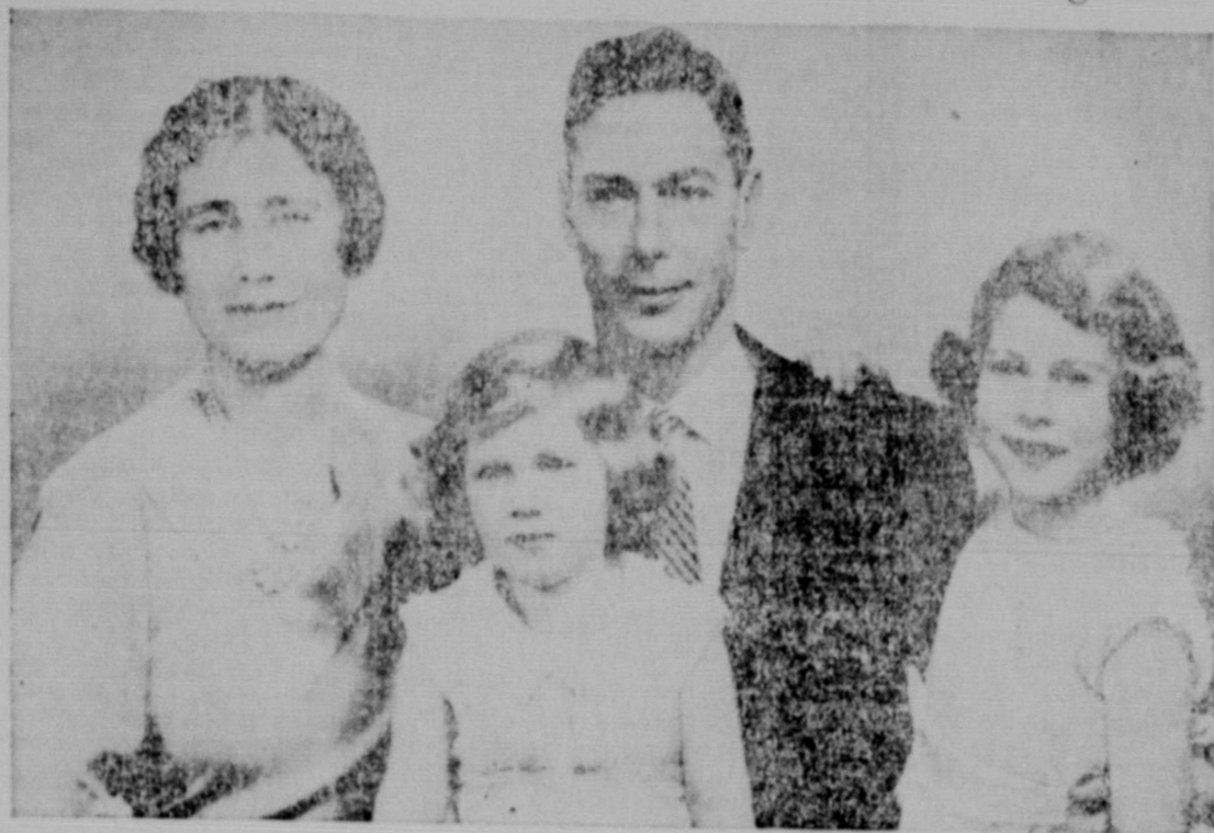
On the abdication of King Edward VIII, to marry Mrs. Wallis Simpson, his brother, the Duke of York, ascended the throne of England as George VI. It is expected the coronation will take place next June. Bringing a dispute which had brought the empire to a crisis, Edward voluntarily relinquished the throne. Photo shows King George with Queen Elizabeth and daughters, Princesses Elizabeth and Margaret Rose.