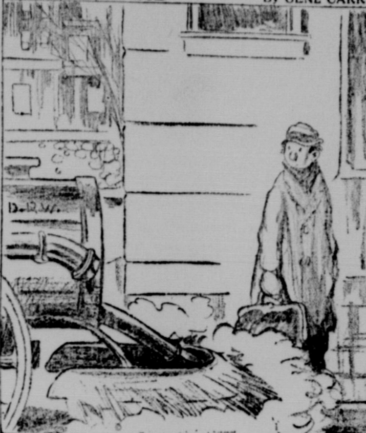
"Sap, to Think Anything Would Grow on Cobble Stones."

A. A beloved Catholic priest who disappeared from sight in 1872 while on his way from Brownsville to Roma. Ten years later his bones were found by cowboys, his saddle hanging from a mesquite tree, his belongings undisturbed. It is thought he died of illness. His remains were buried at Mercedes and his belongings placed in a case at Immaculate Conception in Brownsville.