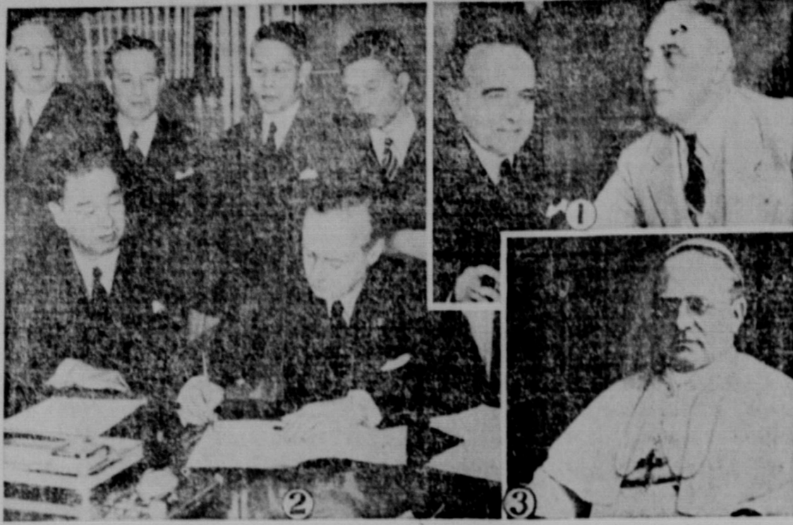
1—President Roosevelt shown as the guest of President Vargas of Brazil on his recent South American tour. 2—German and Japanese diplomatic representatives in Berlin signing treaty agreeing to combat communism, an action which Russia believes is aimed at the Soviet government. 3—Portrait of Pope Pius XI made before his illness.