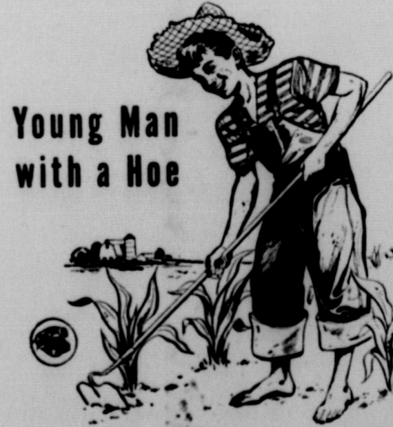
Young Man with a Hoe