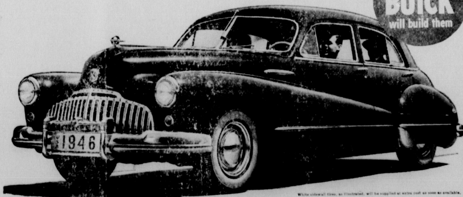
White sidewall tires, as illustrated, will be supplied at extra cost as soon as available.

When better automobiles are built BUICK will build them