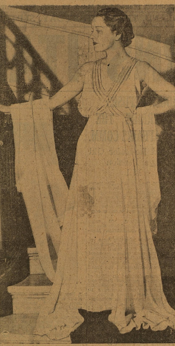
The Greeks had a word for it, but fashionists can't find enough words to express their approval of the Grecian mode for formal gowns.