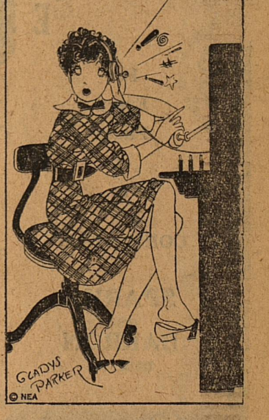
When telephoning, too many grouchy people think they're talking over barbed wires.

Flapper Fanny Says: REG. U. S. PAT. OFF.