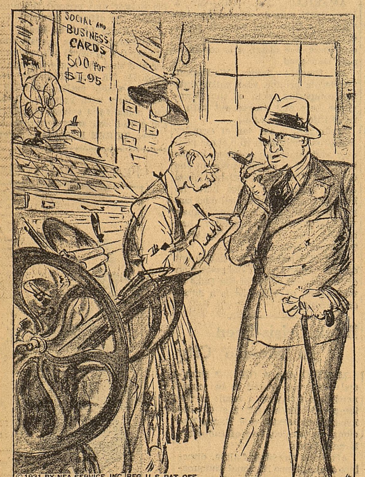
"And what business, Mr. Scorpo?" "Oh, I dunno-name some good rackets."