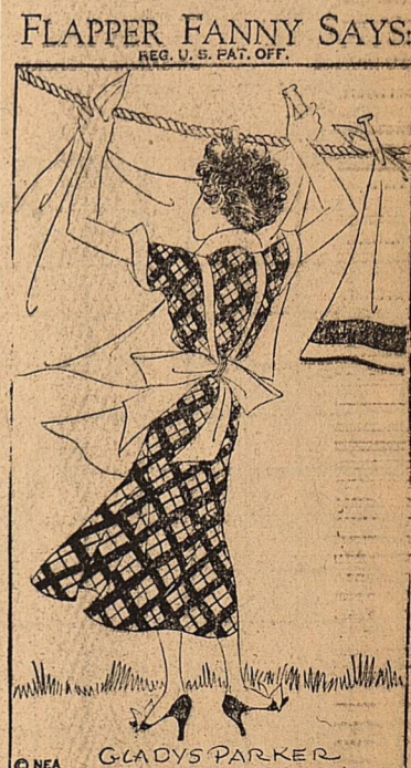
The girl uses clothes and a line to get a husband and then uses a clothes line to keep him.