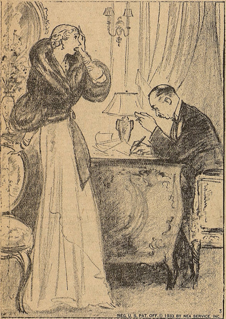
"Good heavens, Henry, are we going to waste another evening at home, worrying over your silly, old income?"