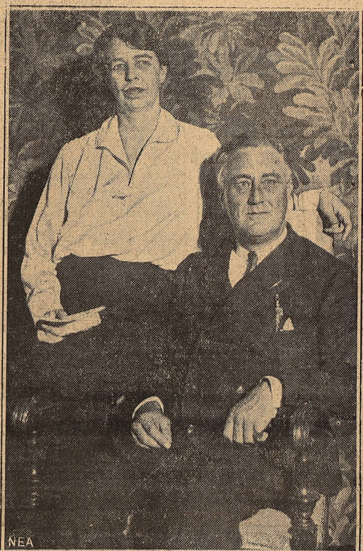
President-elect and Mrs. Franklin D. Roosevelt posed in this informal fashion at their Hyde Park, N. Y., residence where they rested up prior to his taking the oath Saturday.

TOKYO, March 3. (UP).—Toll from an island earthquake and tidal wave was estimated today at 1,535, and 948 missing, with thousands of homes demolished. Twelve provinces were worst hit, with half the total damage there. Fire followed in some cities, with 3,000 houses burned at Kamaishi. Tokyo and Yokohama were violently shaken. The quake was the worst since 1923.