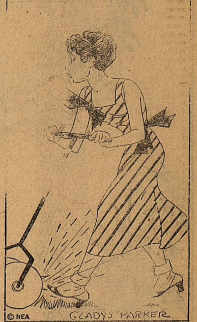
Some girls delight in treating gay young blades in a cutting manner.