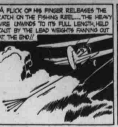
A FLICK OF HIS FINGER RELEASES THE CATCH ON THE FISHING REEL...THE HEAVY WIRE UNWINDS TO ITS FULL LENGTH, HELD TAUT BY THE LEAD WEIGHTS FANNING OUT AT THE END!!