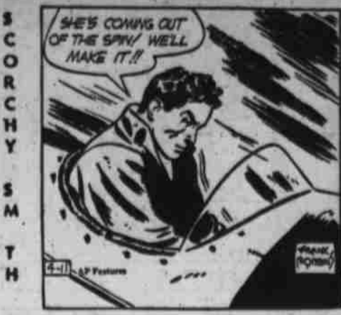
SHE'S COMING OUT OF THE SPIN! WELL MAKE IT!