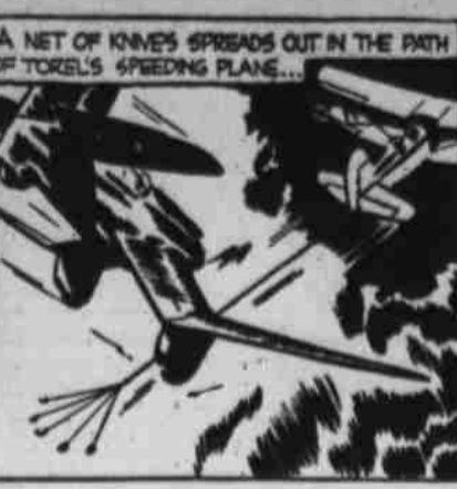
A NET OF KNIVES SPREADS OUT IN THE PATH OF TUREL'S SPEEDING PLANE...