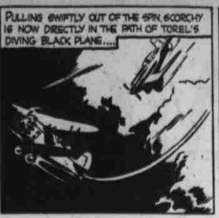
PULLING DIRECTLY OUT OF THE SPIN, GORCHY IS NOW SWIFTLY IN THE PATH OF TUREL'S DIVING BLACK PLANE...