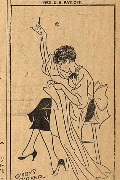
All girls aren't as old-fashioned as they seem.