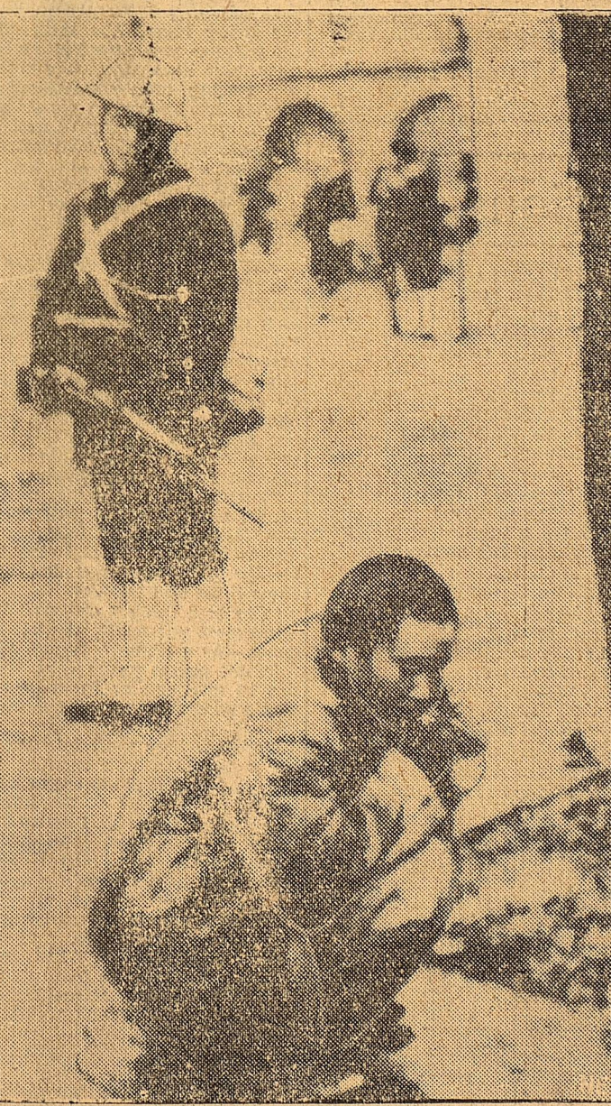
Bayonet poised for the death stroke while his terrified Chinese prisoner crouched in prayer before him, a Japanese military executioner is shown in the exclusive telephoto picture above, taken just behind the front lines during fighting for control of Shanghai. During the fierce battle around Shanghai's North Station at the edge of the International Settlement, military courts were dispensed with and no mercy shown accused snipers. Within a few seconds after this picture was taken the Chinese prisoner was dead.