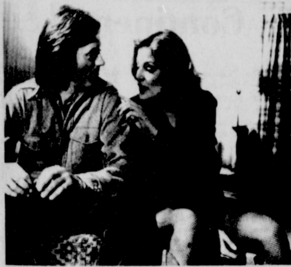
7808-67-18 BUDDING ROMANCE — Rane (Peter Fonda) and Pickup (Helen Shaver) aren't your usual romantic couple. He's a professional motorcyclist fighting a group of hijackers, she's a gutsy, sexy semi-driver and they both spell trouble for the bad guys in American International's "High-Ballin'." The film opens Aug. 2-8 at the Lyric.

We the Board and members of the Golden Spread Center would like to express our sincere thanks to those who worked with us in Arts and Crafts and to those who contributed to the bazaar. We love you for your support. If you are not a member we invite you to become one and enjoy this lovely facility with us.