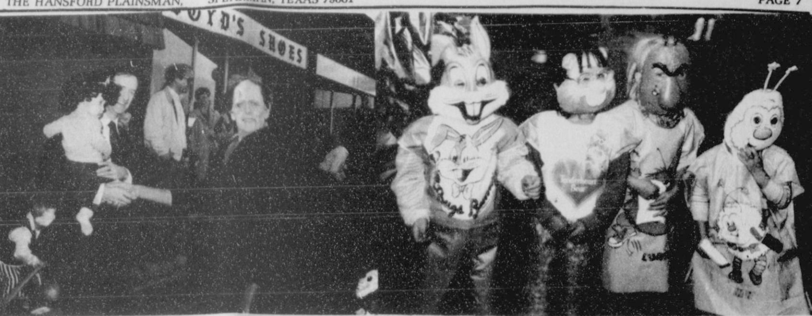
The return of Frankenstein visiting baby Brock and Daddy