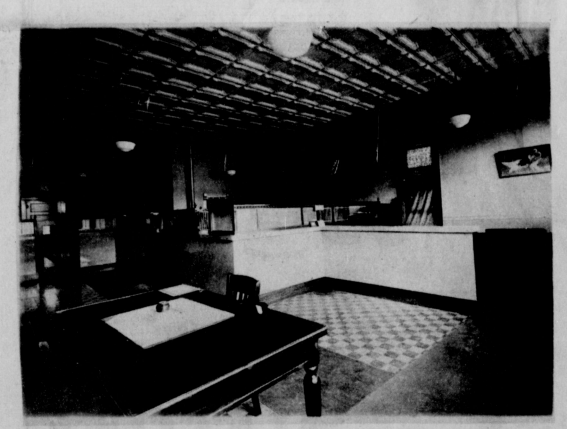
The picture above was made in 1937, when the FIRST STATE BANK

All of us join in saluting the First State Bank on their 60th Anniversary