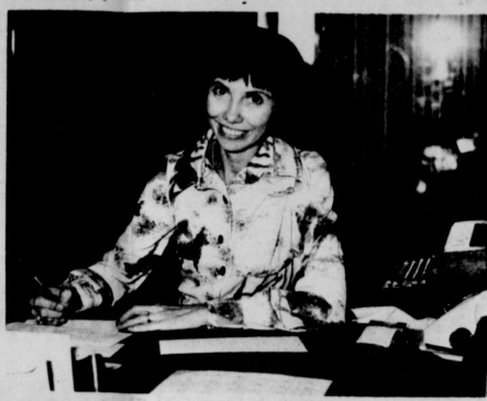
The Hansford Plainsman proudly presents some of the First State Bank employees!

These two attractive ladies not only add to the pleasant decor of the bank with their radiant smiles, they make your banking tasks enjoyable.