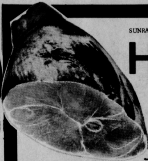
SUNRAY Hickory Smoked

Shurfresh 2 lbs. CHEESE SPREAD 89¢ | Shurfine Halves Bartlett No. 303 Can PEARS 4 for $1.