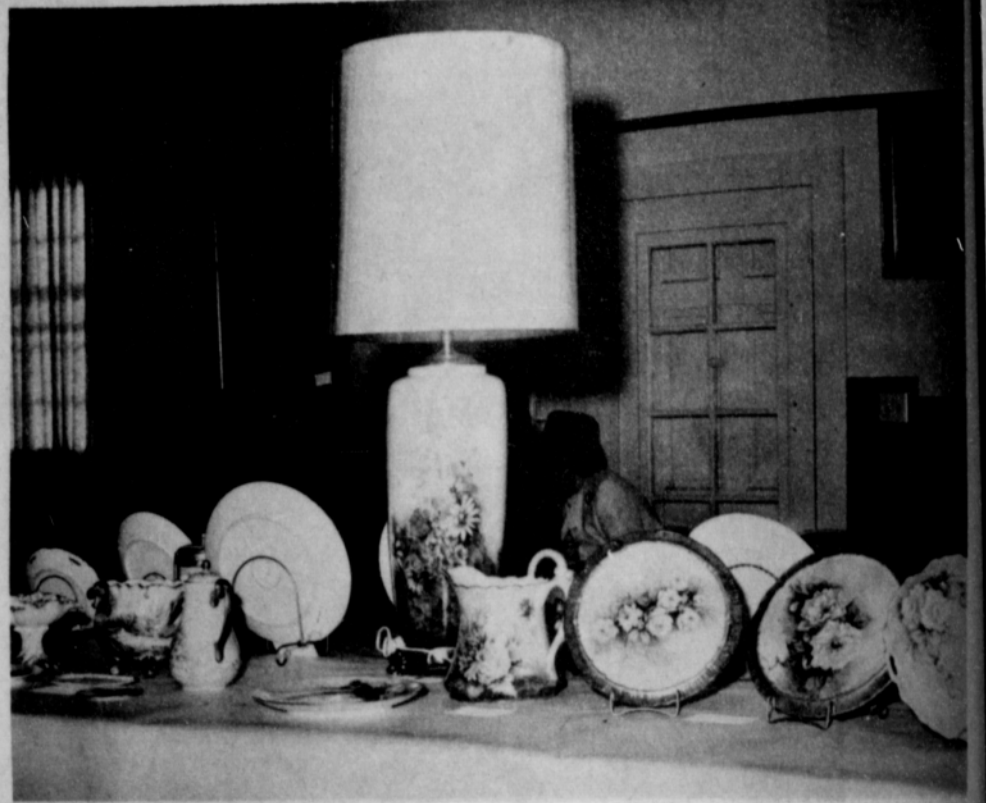
ART SHOW - These are some of the china paintings exhibited Thursday at the area art show sponsored by the Twentieth Century Club of Spearman. The show featured tole painting, oil painting, china painting, needlepoint and other needlework.

One out of every eight American women is now a widow, and in the 67 to 74-year-old range, two out of every five are in this category.