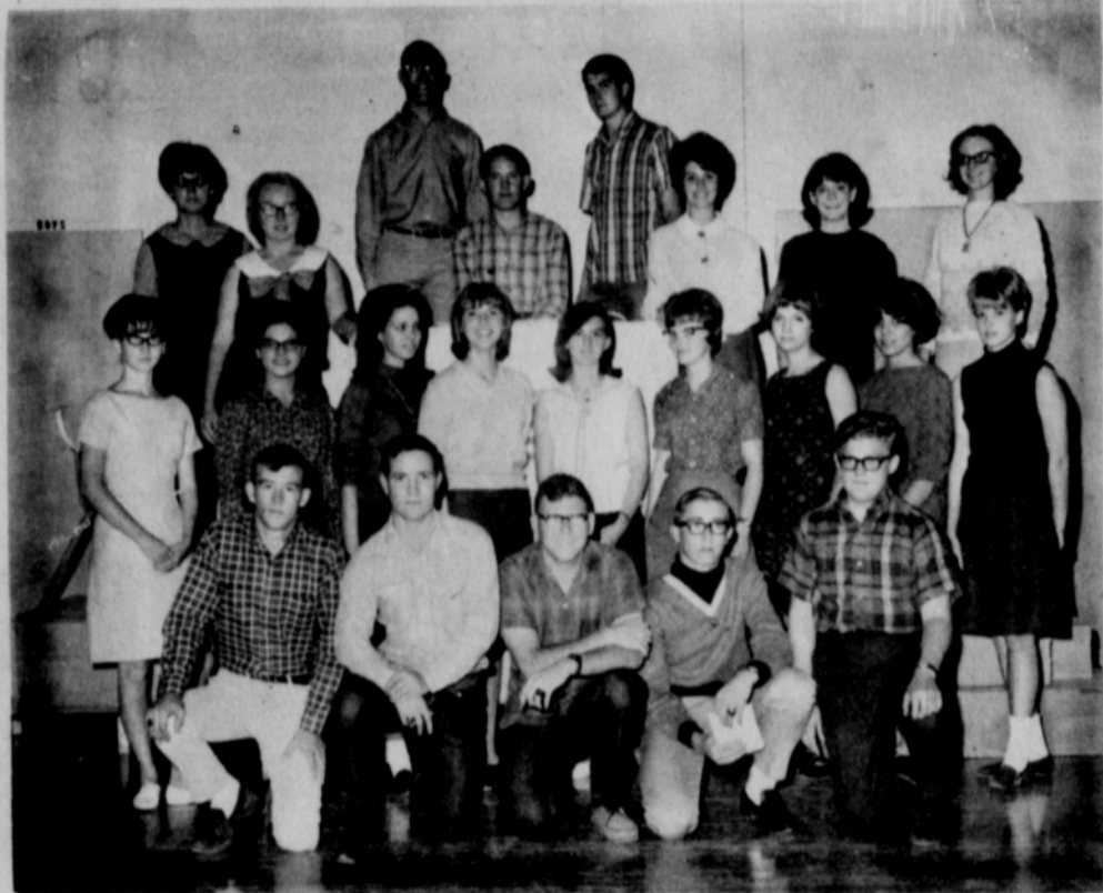
JANUARY 16- These speech students will present the Play "The Night of January 16" in the high school auditorium Tuesday night. Twelve cast members are missing. They are the members of the jury which will be picked from the audience.