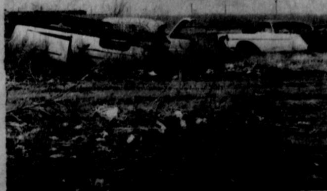
OLD WRECKS -- Old car bodies and abandoned car bodies scattered all over town on vacant lots and behind houses give an appearance of a giant junk yard.