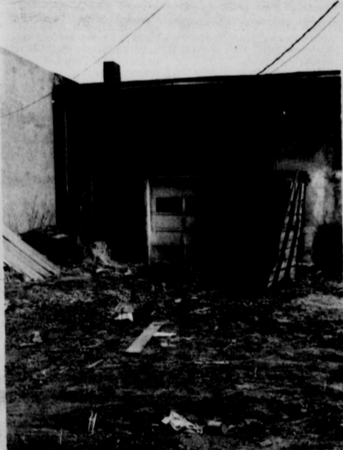
BACKYARDS -- The rear of many of the business places in Spearman need cleaning along with the alleys.

Are We Crumbs or a Town of People With Pride?