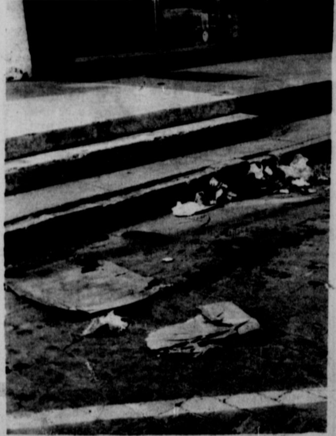
BLOWING TRASH -- Trash and weeds from alleys and lots quickly make Main Street look like a trash heap and does away with the work of the street sweepers.